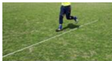
Figure 2. Triple hop test.

This test required a narrow measuring tape that was 6 m long, securely positioned on the ground (Figure 2). The test involved performing three consecutive hops by traveling the maximum distance possible and landing on the same foot in each hop, and ultimately maintaining the landing mode for at least 3 s. Hand movements can be used to maintain balance. After performing two or three attempts, the subject does a triple hop two times for the dominant leg, and the total distance traveled is recorded [25]. The rest time was 60 s between three trials, and the rest time was 120 s between each of the hop/jump test.