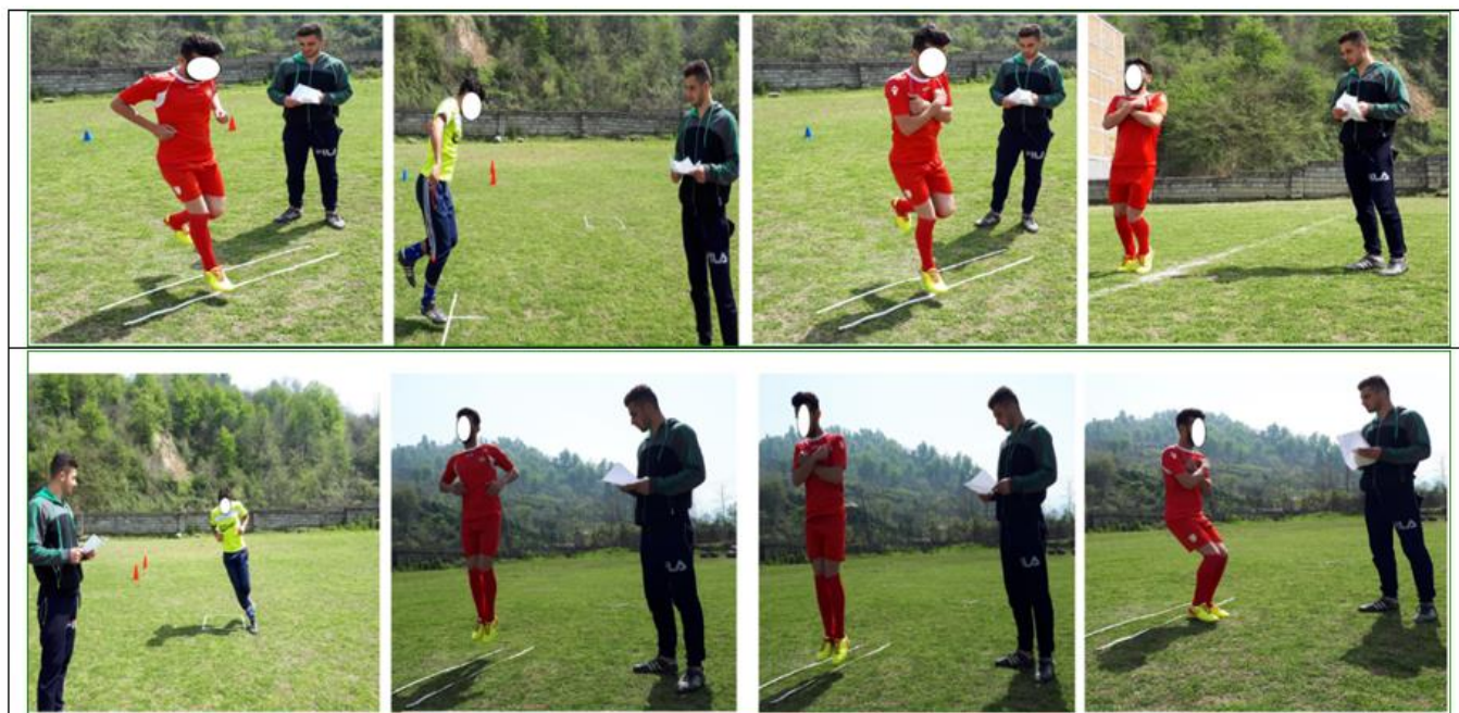
Figure 4. Examples of hopping exercises.