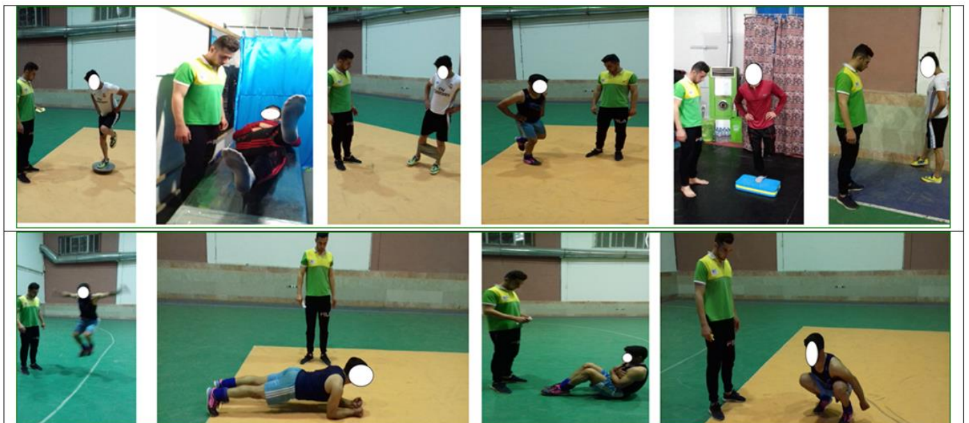
Figure 3. Examples of the balance plus strength exercises.

The balance plus strength training protocol consisted of balance and strength types of exercises (examples in Figure 3) that were performed over eight weeks (three sessions per week), 45–60 min per session. Additionally, the intensity of exercise increased, with an increasing number of sets and repeated movements, every two weeks. Specifically, the intensity of exercise increased (sets and repetitions) by observing the principle of overload for each person. Rest between sets lasted 30 s and rest between exercises lasted 1 min (Table 1) [7]. Before and during the balance and exercises, the players were instructed to focus their strength to hold proper alignment of their body, to maintain a visual point on the front floor, to ensure the full alignment of the body, to not bend forward from the waist while undertaking a single leg squat and squat, to not drop the pelvis on the “bridge to plank”, and to raise your knees as much as possible in the tuck jump.