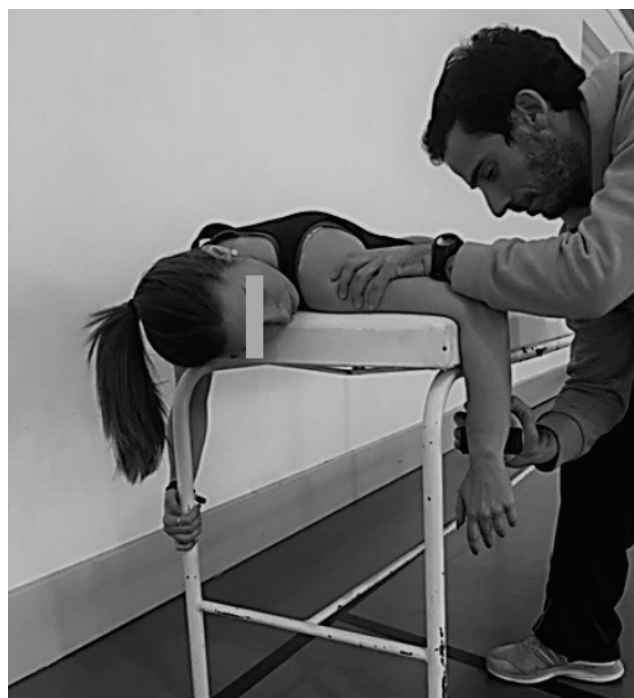
Fig. 2. Shoulder Internal Rotation measurement

The maximal IR and ER isometric strength was evaluated with two repetitions for each shoulder and