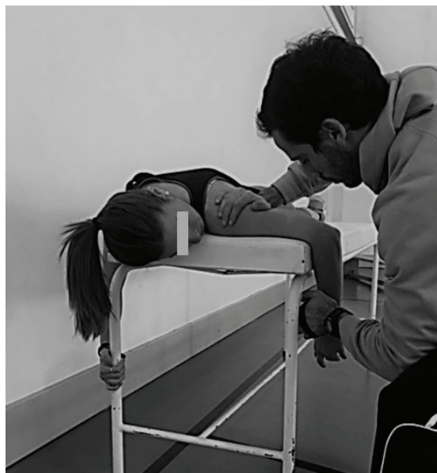
Fig. 1. Shoulder External Rotation measurement

positioning, participants performed a warm-up protocol that consisted of 2 submaximal and 1 maximal isometric contraction in each direction, separated by 30 seconds of rest [25].