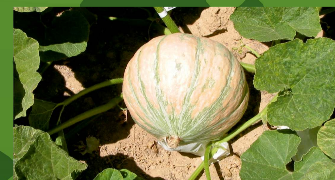
Figure 3. Pumpkin "Monteluz"